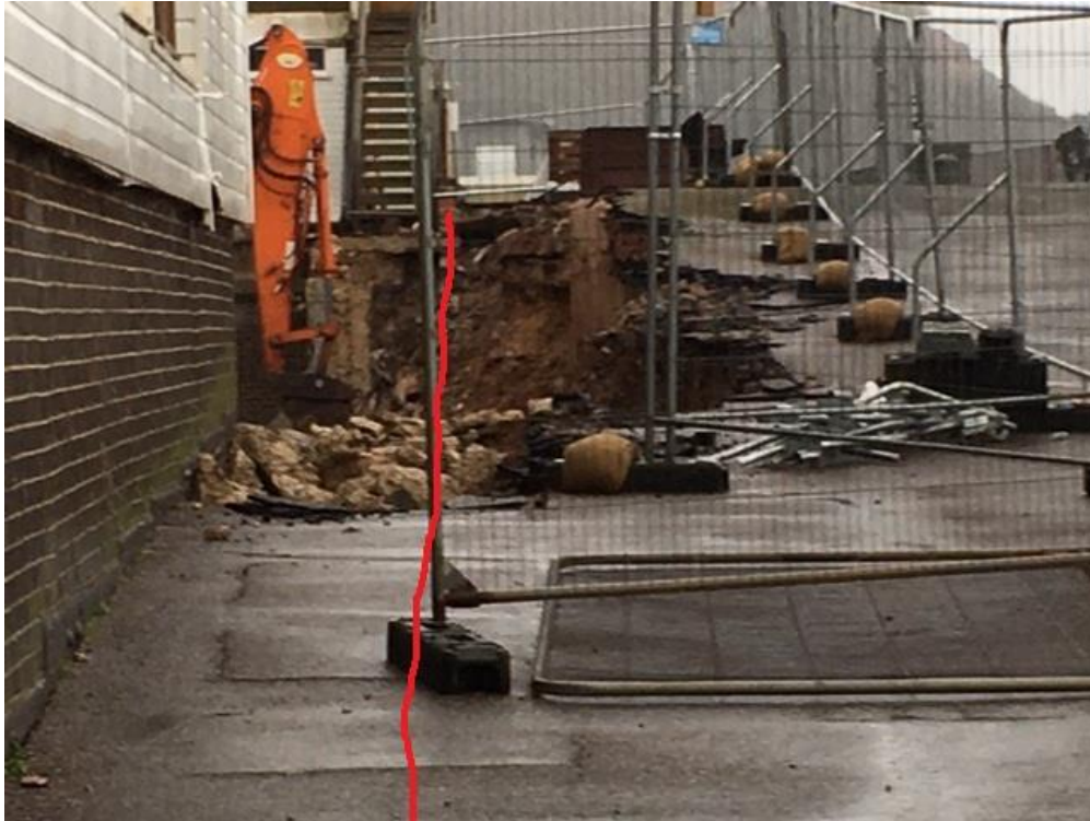
Red line indicates approximate site boundary. Council land to the right of red line.